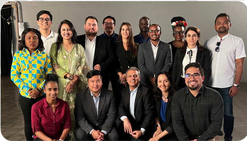
GTAZ Journalism delegation, 17 countries represented