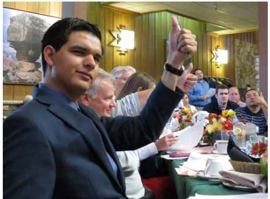
105th Town Hall, Arizona's Economy, Grand Canyon