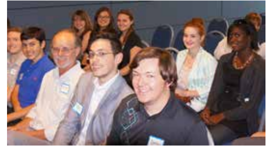
105th Future Leaders Town Hall, Peoria

Hundreds of high school and college students from around Arizona experienced civic participation first hand using Arizona Town Hall's model of civil discourse at Future Leaders Town Halls on the topics of Vulnerable Populations and Arizona's Economy . These events consistently receive rave reviews and have engaged the next generation of leaders in the Town Hall process, discussions and recommendations.