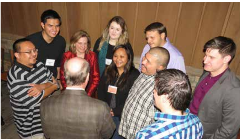
105th Town Hall, Arizona's Economy, Grand Canyon

Each year Arizona Town Hall addresses important issues that affect Arizona. In the spring, Arizona Town Hall met in Tucson to address Vulnerable Populations . In the fall, Arizona Town Hall met at the Grand Canyon to address Arizona's Economy . Both Town Halls were well attended. The Spring Town Hall was particularly noteworthy because of its focus on vulnerability, a condition that affects diverse groups of people who are vulnerable to loss or injury for different reasons.