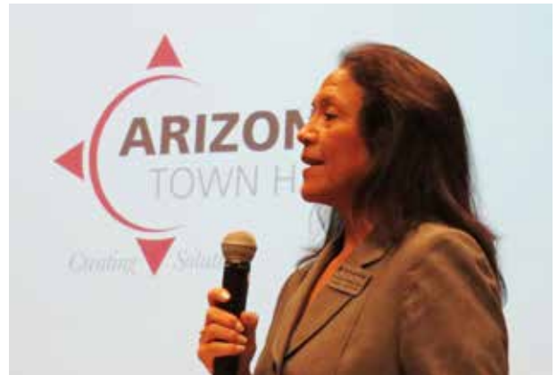
105th Community Outreach Program, Tucson

Individuals who participated in the Town Hall discussions serve as presenters for the Community Outreach Programs and share their thoughts on the recommendations. The audience members receive the printed highlights piece and are invited to engage in a Town Hall style discussion about the priorities described in the piece. Consensus recommendations are generated at each Outreach Program.