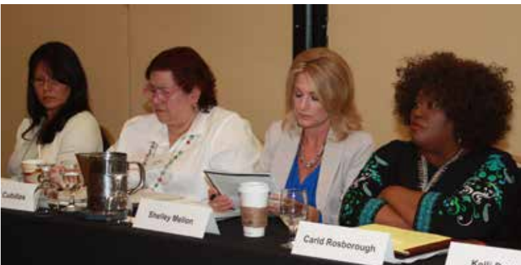
104th Town Hall, Vulnerable Populations, Tucson