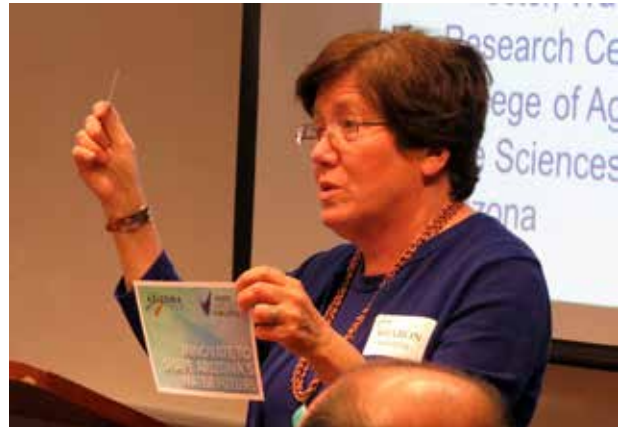
107th Community Outreach Program, Tucson

After the statewide Town Hall, recommendations are communicated to a broader audience through traditional and social media, published reports, and Community Outreach Programs held around the state.