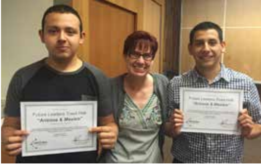
108th Future Leaders Town Hall, South Mountain Community College

Hundreds of high school and college students from around Arizona experienced civic participation at Future Leaders Town Halls on the topics of Arizona & Mexico and Financing Arizona's Future . These events develop civic leadership skills for Arizona's next generation of leaders.