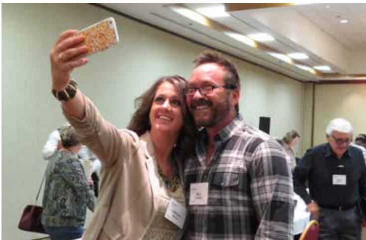
109th Town Hall, Financing Arizona's Future, Mesa

Each year Arizona Town Hall addresses important issues that affect Arizona. In the spring, Arizona Town Hall met in Tucson to address Arizona & Mexico . In the fall, Arizona Town Hall met in Mesa to address Financing Arizona's Future .