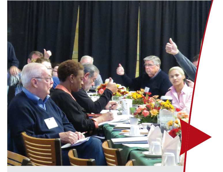
After amendments were presented at Wednesday's plenary session, participants give the "thumbs up" for amendments to be included in the final report.