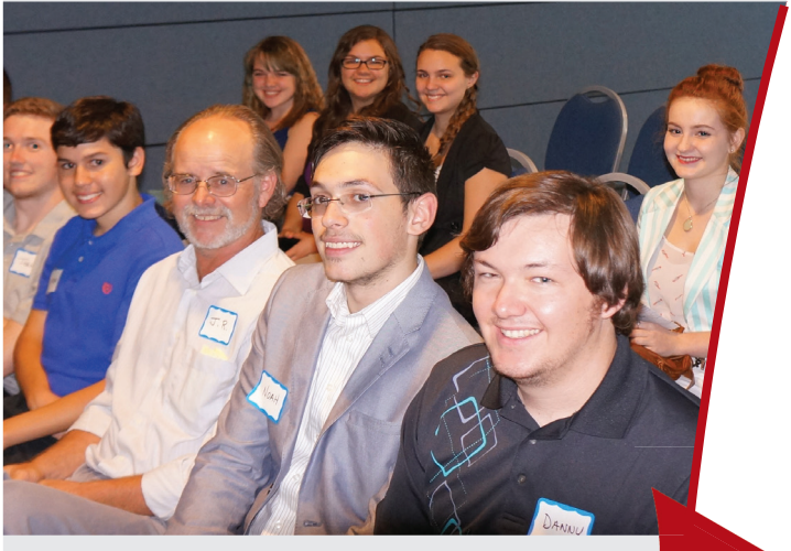
Participants of the Future Leaders Town Hall held in Peoria.