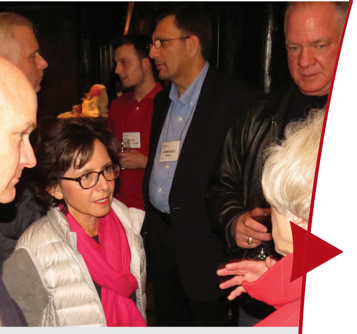
Participants have the opportunity to talk with others from around the state and make lasting connections during the intense three-day discussions.